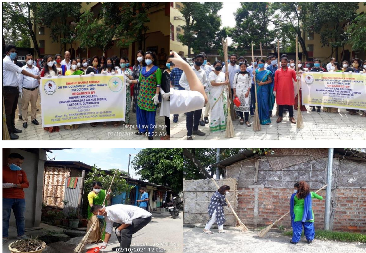
Fig.3: Swachh Bharat Abhiyan in consonance with the Gandhian principle of cleanliness conducted in the near vicinity of Dispur Law College in collaboration with SADICHSA, a NGO of Assam.

The next programme was a Swachh Bharat Abhiyan in consonance with the Gandhian principle of cleanliness. The cleanliness drive was conducted in the near vicinity of Dispur Law College in collaboration with SADICHSA, a NGO. Faculties and Students joined hands with the members of SADICHSA to clean the approach road to Dispur Law College.