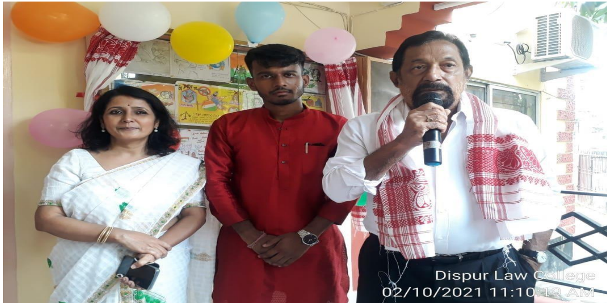
Fig.1: Inauguration of the Wall Magazine on Poster Making Competition by Sri Atul Bora, MLA

Then the hon'ble minister made a plantation within the campus of the college. Faculties of the College also made plantations within the campus pledged to look after the trees by regularly watering them with their own hands. The trees planted were "Bokul" and "Deodhar". Botanically known as Mimusops elengi . Bakul is a very beautiful tree. The tree bears creamy white fragrant flowers and ovoid berries. Bakula has fresh and sweet-smelling fragrance. It is an evergreen tree and it has distinctive appearance due to its dark bark with deep fissures. The Deodar cedar ( Cedrus deodara ) is an evergreen conifer tree that is favoured for its weeping habit (gracefully drooping branches). The motto was to "Go Green" within the Campus with these beautiful trees.