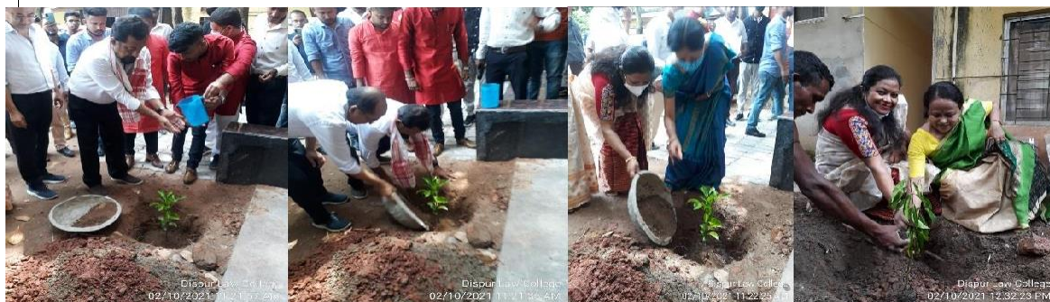
Fig.2: Plantation of "Bokul" and "Deodhar" plant by hon'ble minister and Faculties of the College

Then the hon'ble minister made a plantation within the campus of the college. Faculties of the College also made plantations within the campus pledged to look after the trees by regularly watering them with their own hands. The trees planted were "Bokul" and "Deodhar". Botanically known as Mimusops elengi . Bakul is a very beautiful tree. The tree bears creamy white fragrant flowers and ovoid berries. Bakula has fresh and sweet-smelling fragrance. It is an evergreen tree and it has distinctive appearance due to its dark bark with deep fissures. The Deodar cedar ( Cedrus deodara ) is an evergreen conifer tree that is favoured for its weeping habit (gracefully drooping branches). The motto was to "Go Green" within the Campus with these beautiful trees.