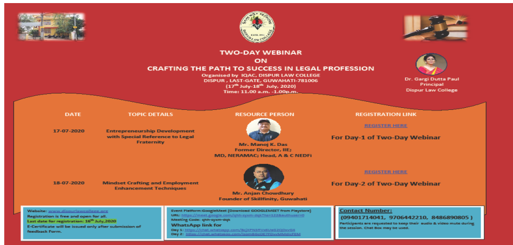
Fig.1: Flyer of the webinar Crafting the Path to Success in Legal Profession