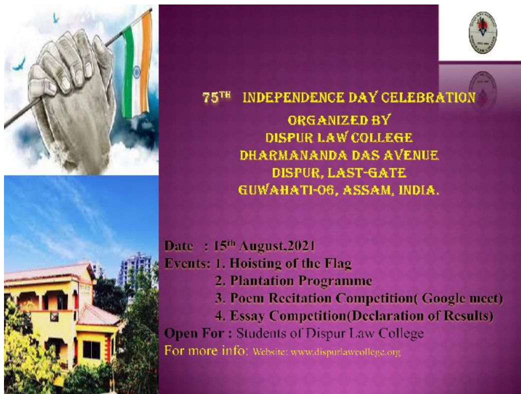
Fig.1: Flier of the 75 th Independence Day Celebration

OBJECTIVES: (1) TO KEEP THE SPIRIT OF PATRIOTISM ALIVE (2) TO INSPIRE THE STUDENTS TO SERVE THE NATION.