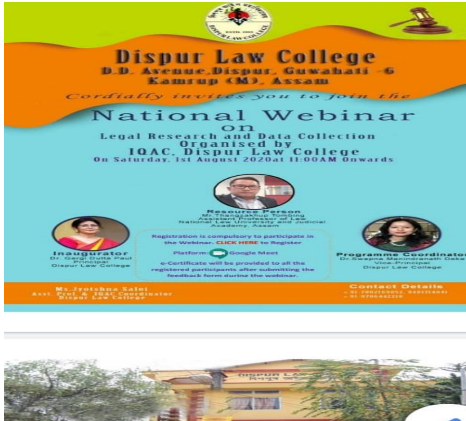
Fig.1: Flyer of the Webinar