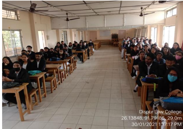
Fig.8: Students attending the award ceremony