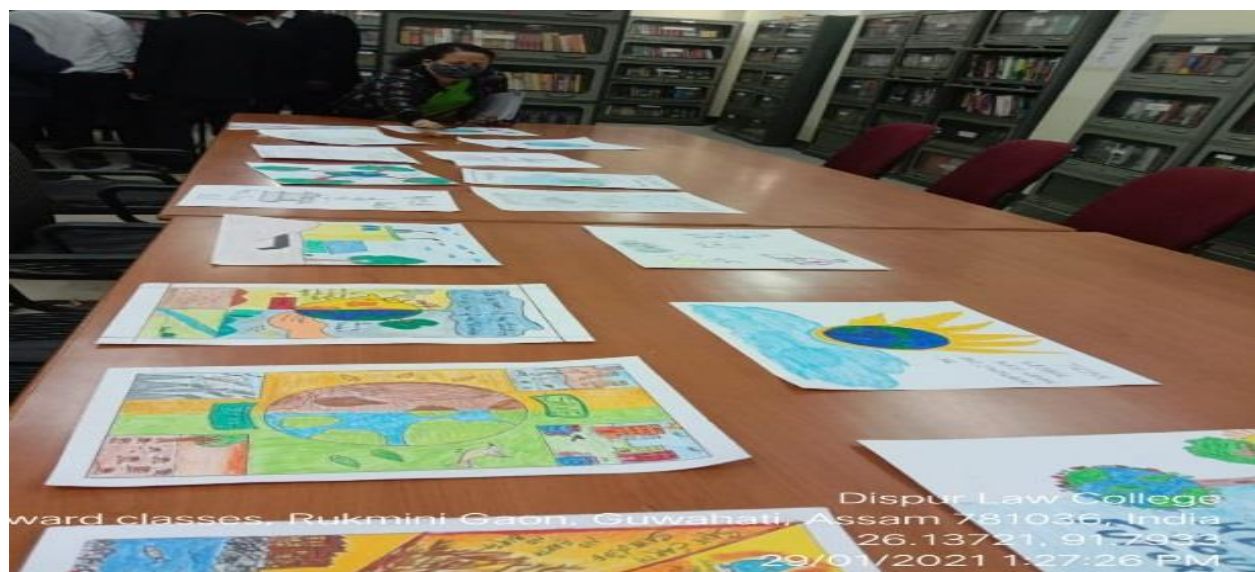
Fig.4: Poster-making Competition