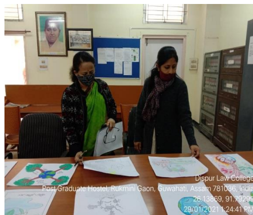
Fig.6: Selection panelists

A Poster-making competition on various themes was organized on 29 th January, 2021 in the Library. Around 17 students participated in the competition. The competition started from 12.00 p.m. and ended at 1.30 p.m.