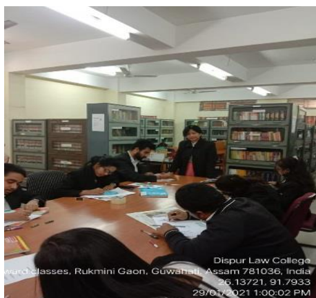
Fig.5: Participants during the competition