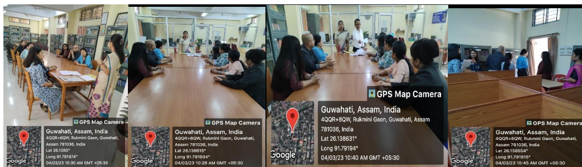
Fig.1: Library Orientation of the students of LL.M. 1 st Semester