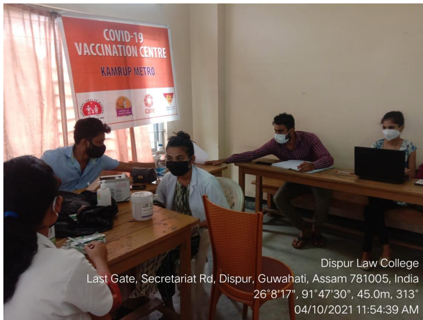
Fig1.: Team of Care India, an international NGO

The Government of India has launched a COVID-19 vaccination campaign, offering free vaccinations to everyone in India around 940 million adults. The current COVID-19 vaccination program is the largest of any adult vaccination effort in India's history. But the program has been marred by controversies like the use of digital apps, websites and high costs that excluded the digitally deprived and rural poor.