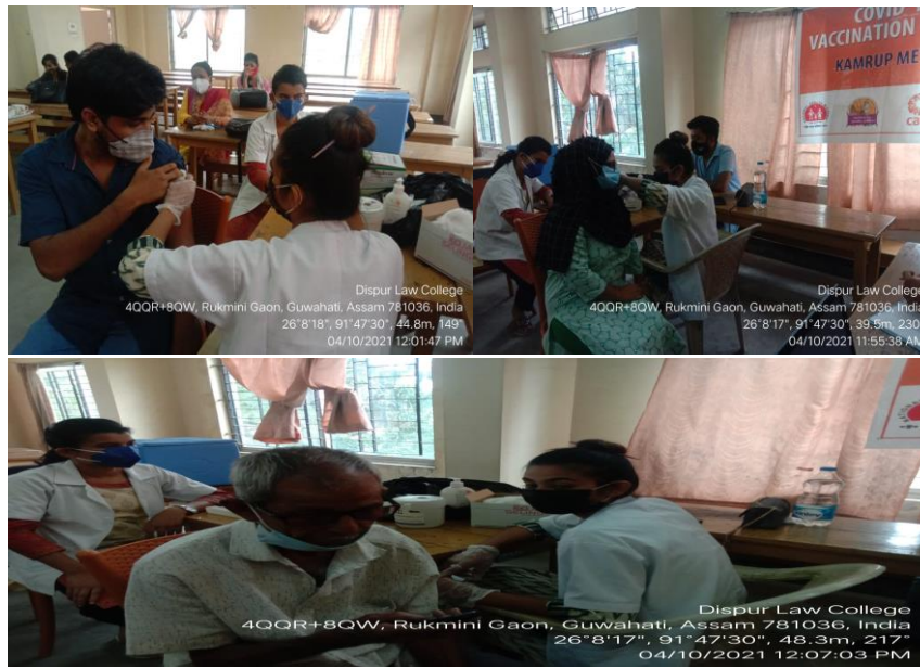
Fig.2: Vaccination drive of Students and Staff

Government of Assam on Covid Vaccination program in nine districts of Assam. A total of twenty-six students either with 1st dose or with no dose were vaccinated with Covid Shield or with Covaxin. Twenty-two students were vaccinated with Covid Shield while four students were vaccinated with Covaxin. Three staff members were also vaccinated along with eight others.