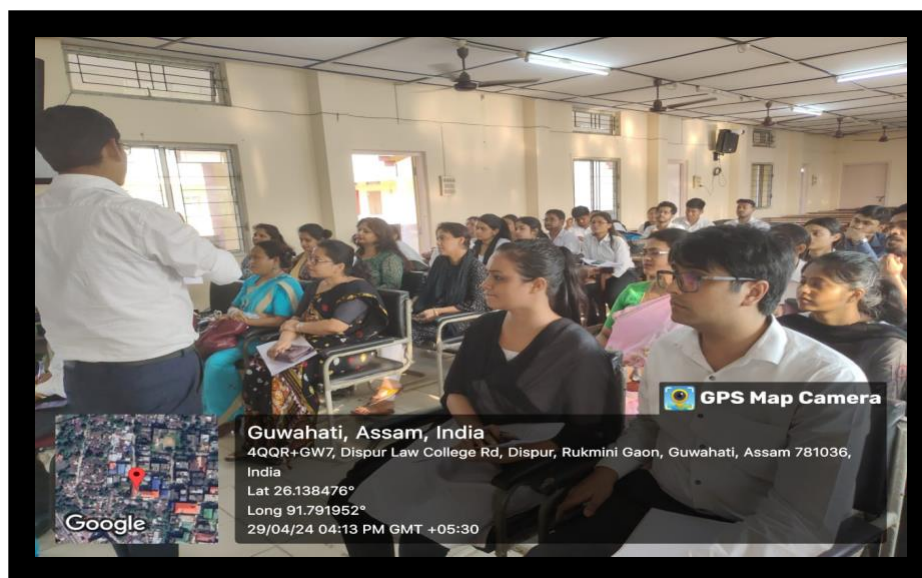
Fig.2: Participants at the workshop