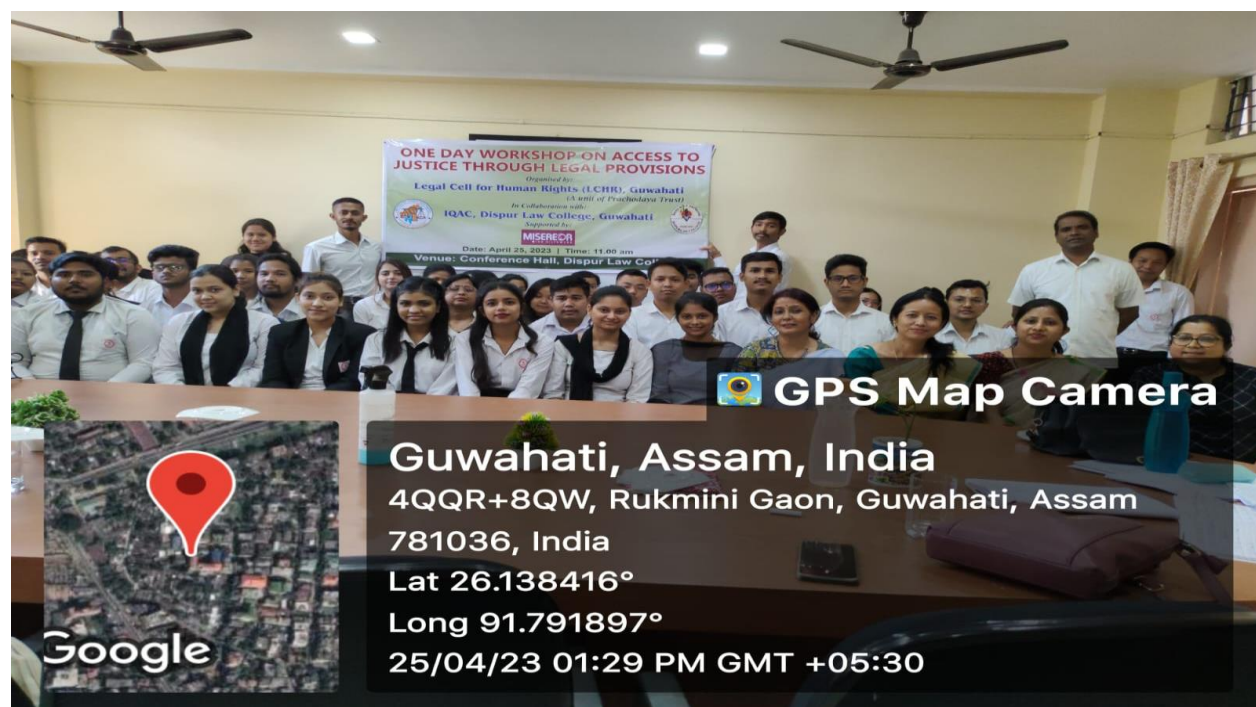
Fig.1: Students and faculty members attending the workshop