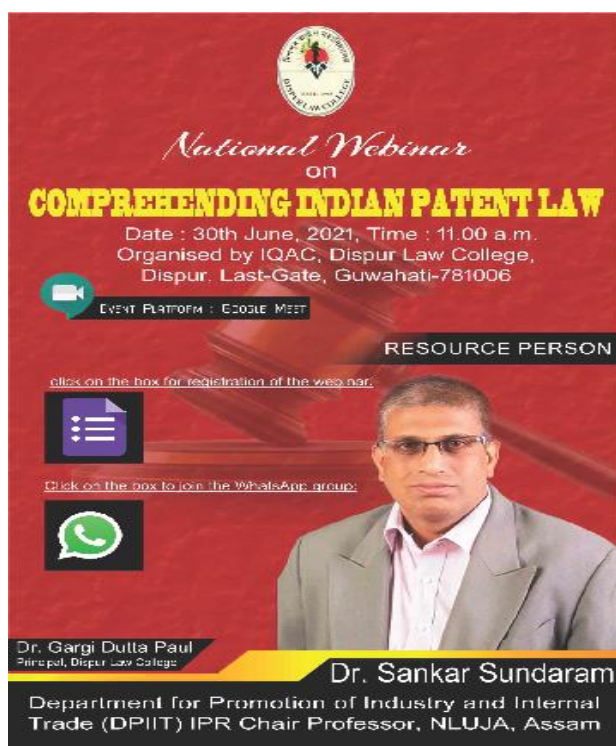
Fig.1: Flyer of the National Webinar