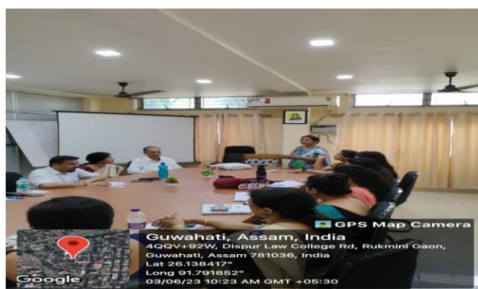
Fig.2: Principal delivering her introductory speech